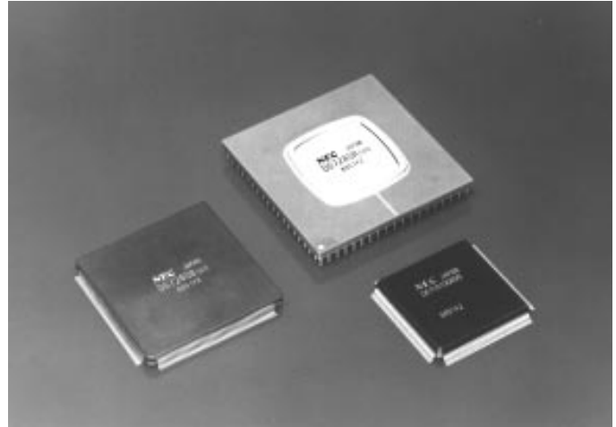
Figure 1. Sample CMOS-8 Packages

Optionally these devices can be powered at 3.3V \pm 0.3V . Also available are 5V libraries characterized at commercial conditions of 5V \pm 5\% and T_j = 0-100^\circ C (CMOS-8T).